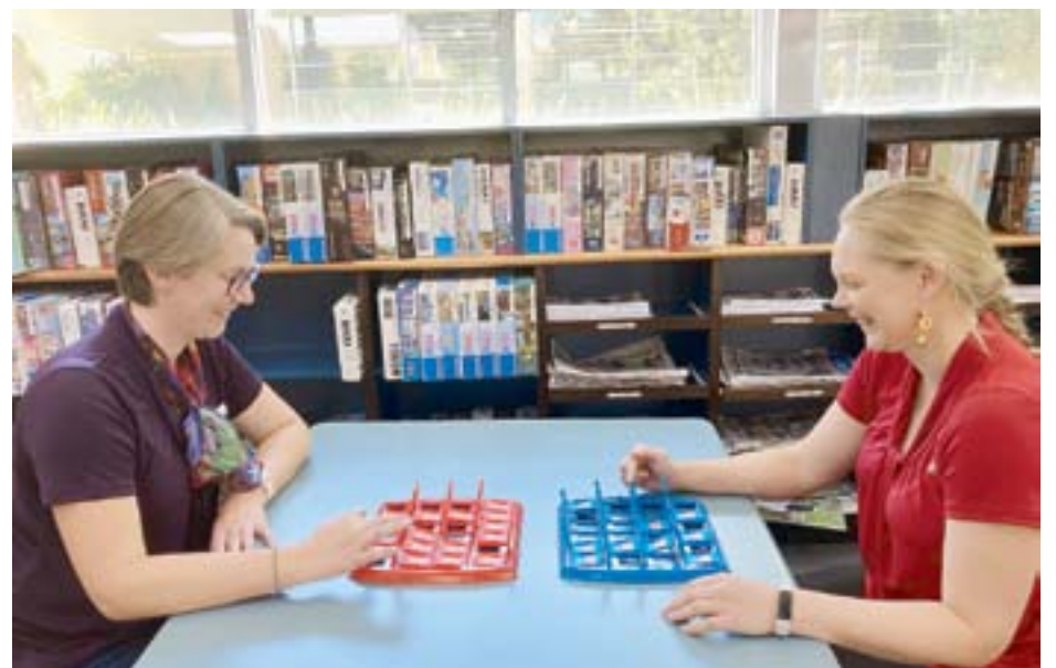
Looking for a games partner? Head to the library.

The Stanthorpe Library will be operating from the Library vehicle in Weeroona Park of a Saturday morning instead of the Stanthorpe Administration Building. Please contact the Stanthorpe Library if you would like to collect items or reservations on a Saturday and staff can make arrangements for your items to be in the vehicle.