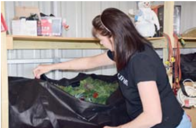
Unzipping the bags.