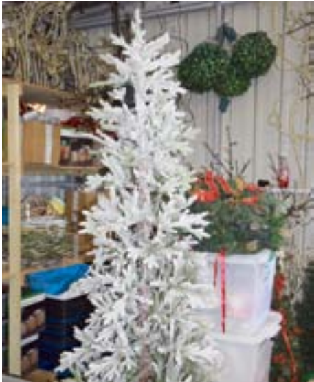
Trees for miles.