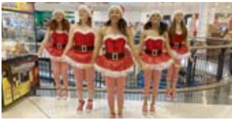
Plenty of entertainment at Rose City this Christmas season.