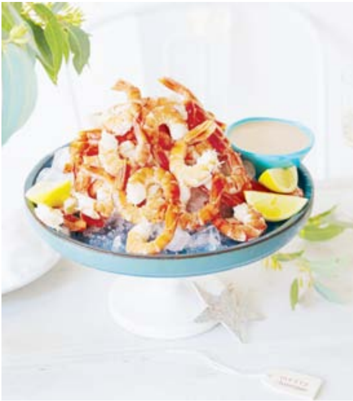
Bought ingredients looking special.