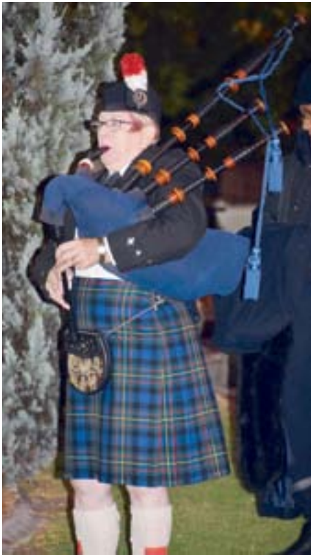
In the early morning gloom comes the swirl of the pipes.