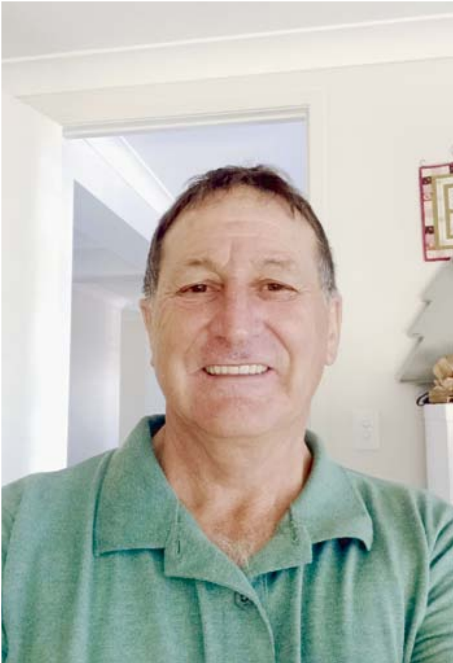
Enjoying his retirement.

I ended up serving twenty or thirty an hour.” Part and parcel of running a fruit shop was the early morning runs to Brisbane for the fruit markets. “You’d have to get up early to go to Brisbane and get a load, but I was pretty blessed really because I use to do it all myself, load my own trucks,” he said. “Towards the end I was getting