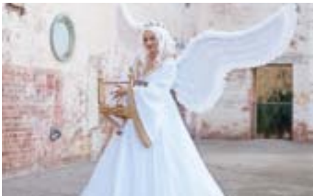
The floating angel.