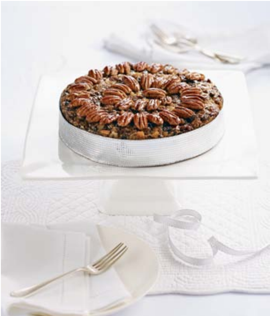
Christmas cake without the fuss but with all the taste.

diabetic brother so I'm always looking out and there is enough sugar in the mixed dried fruit as well. You could really make it with three cups of water, all you need is liquid to reconstitute the dried fruit and it releases all that natural sweetener," she explained. "So that's tip number one – soak it overnight, tip number two is once you've added three cups of self-raising flour, bake it low and slow. So, a good moist, rich, delicious rich fruit cake I bake at 125 degrees for two and a half hours and honestly that everyone asks you for the recipe of and then you've got to kind of make it sound a bit more complicated than what it is.