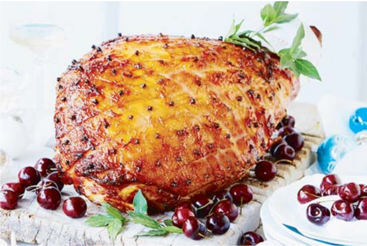
Buy your ham early.