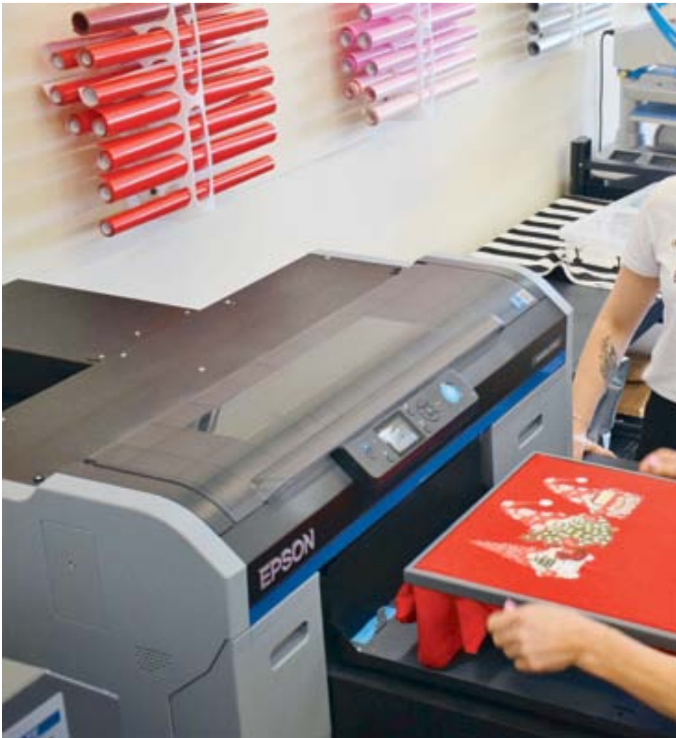
Christmas is coming.