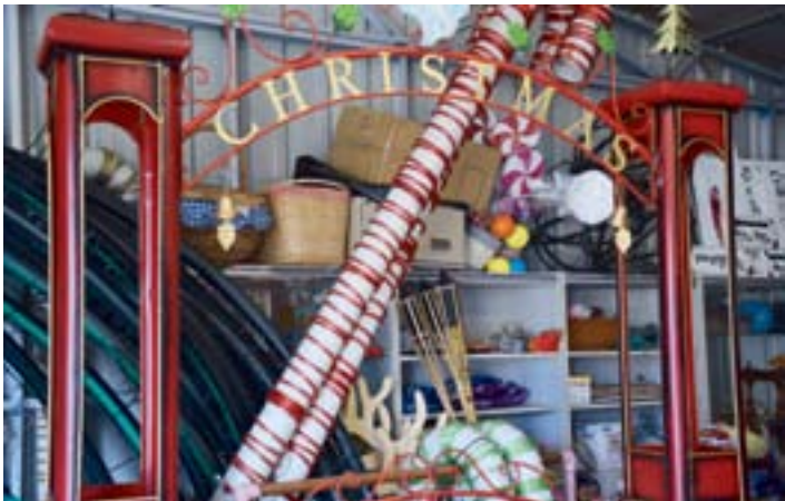
Ready to roll.