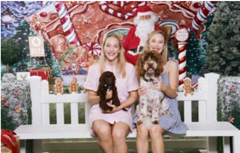
Christmas pictures with pets.

Children can enjoy some downtime and get crafty, make a gift box, tree decorations or design a gift bag.