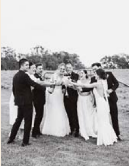
Celebrating in style with the bridal party.