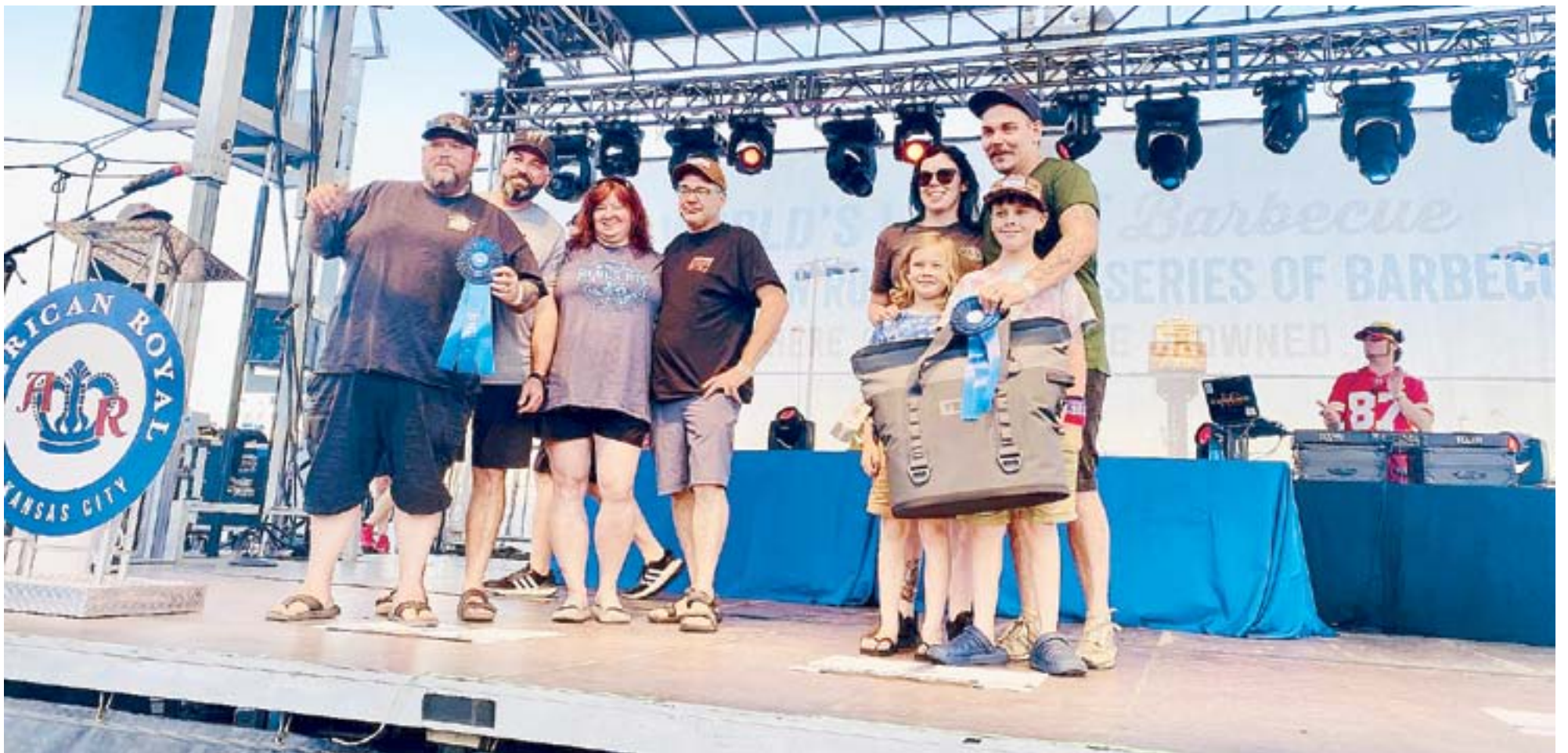
Sharing the stage as winners during the American Royal World Series of Barbecue.