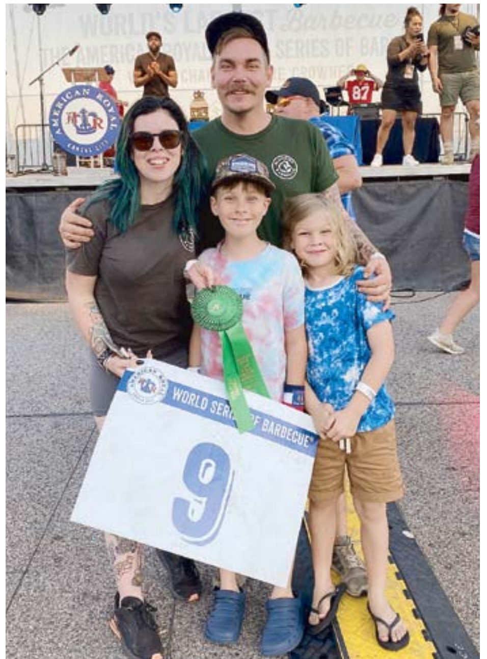
The Bluebird Kitchen family coming home from Kansas with several big awards.

Opening on Tuesday through to Saturday from 8 am – 2 pm, 5.30 pm till late for dinner.