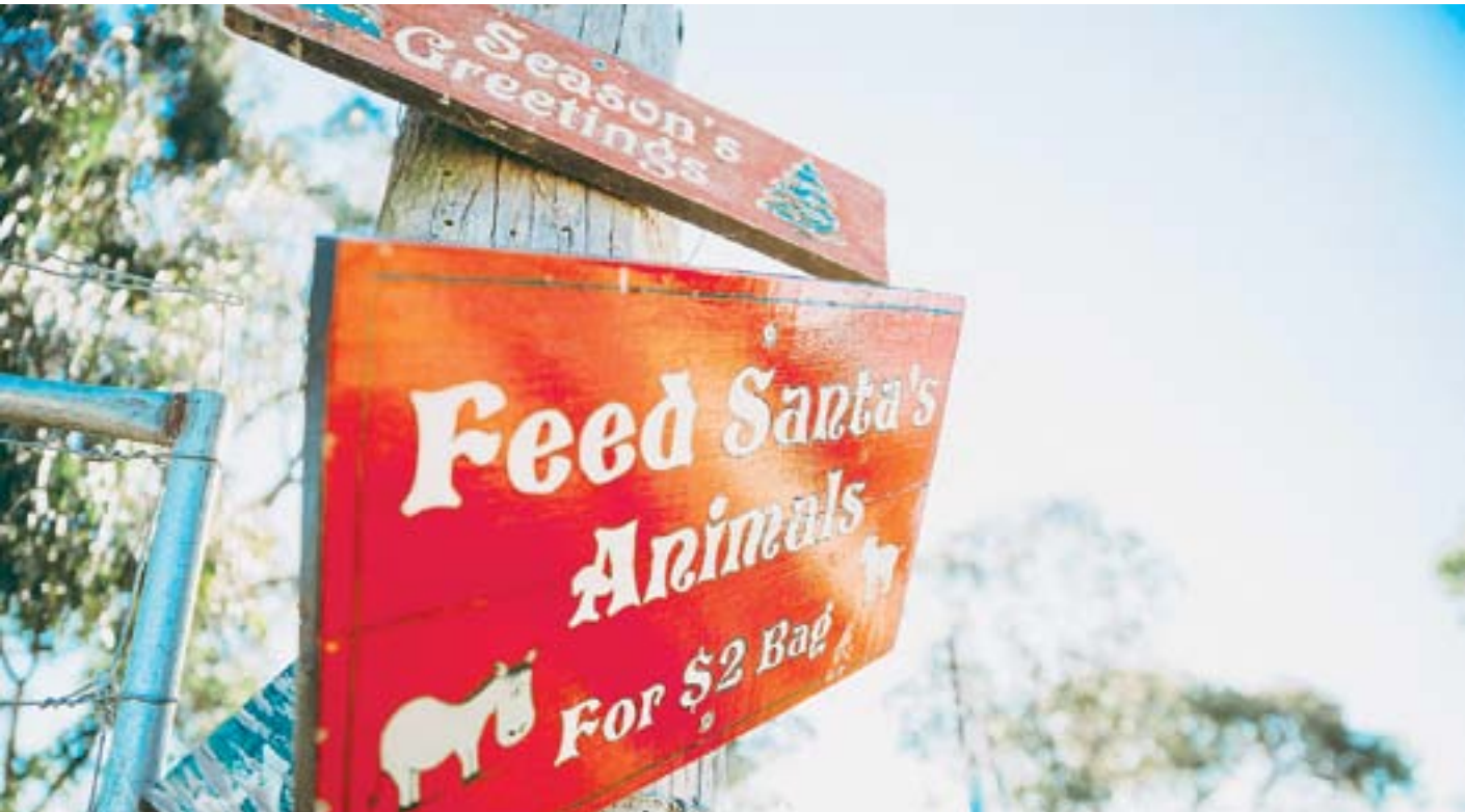
Ready for visiting time.

“We’re just ramping up, we’ve got the baby