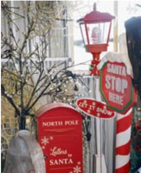
Getting out the decorations.