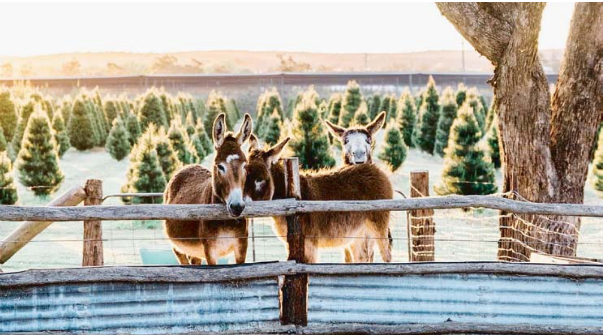
Almost time for Christmas trees.