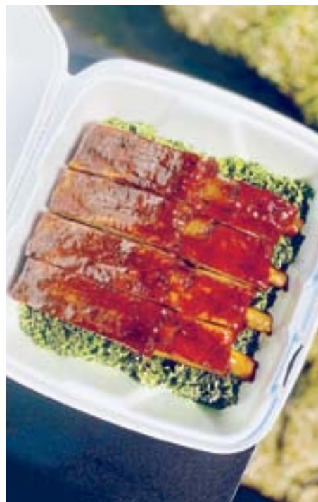
Delicious barbecued meats tempt the Southern Downs residents and visitors.