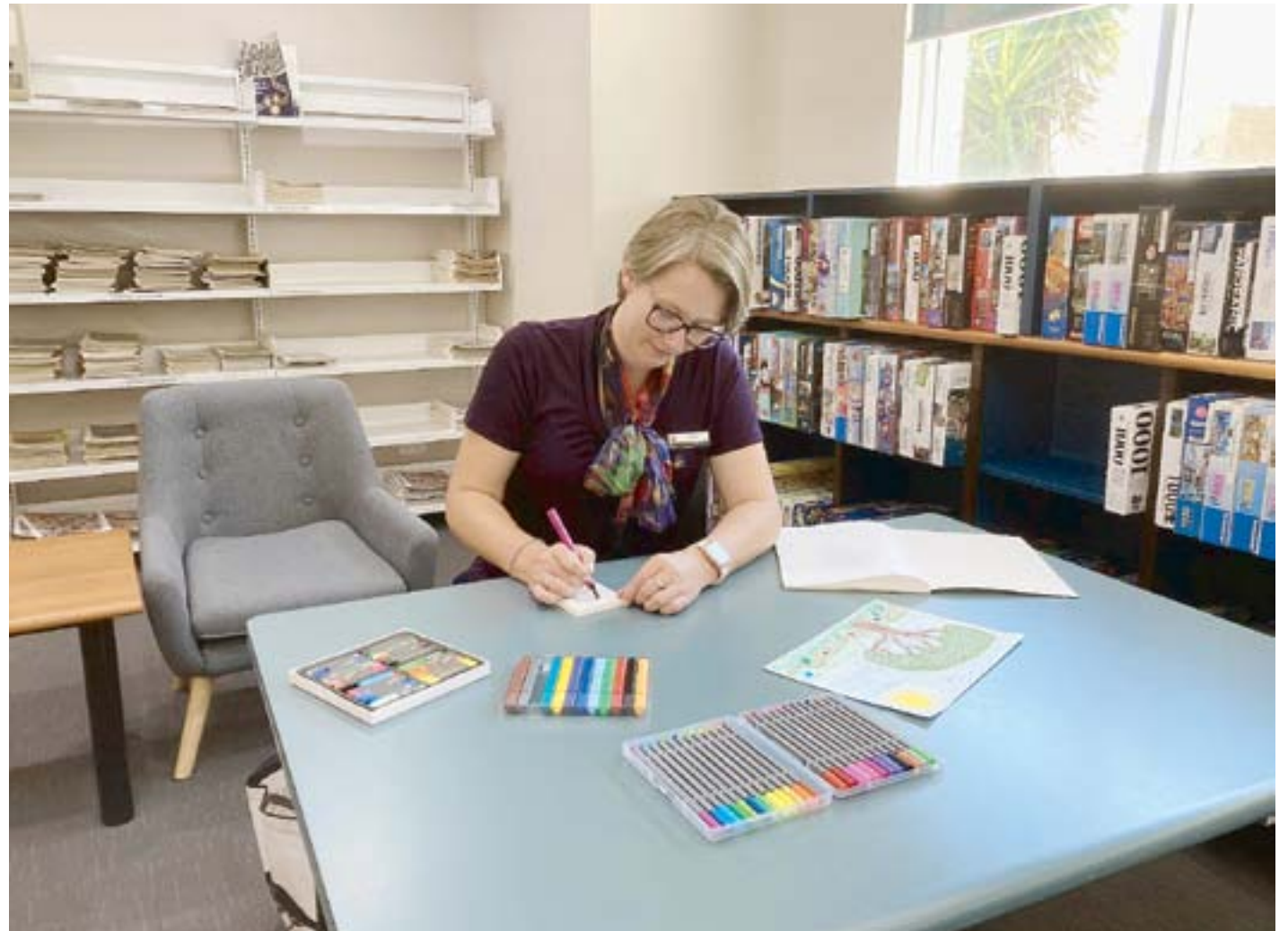
Check out mindful Monday.

Enjoy playing board games but no one to play with? Want to learn how to play board games? Warwick Library is running board game sessions every Wednesday afternoon at 3.30pm