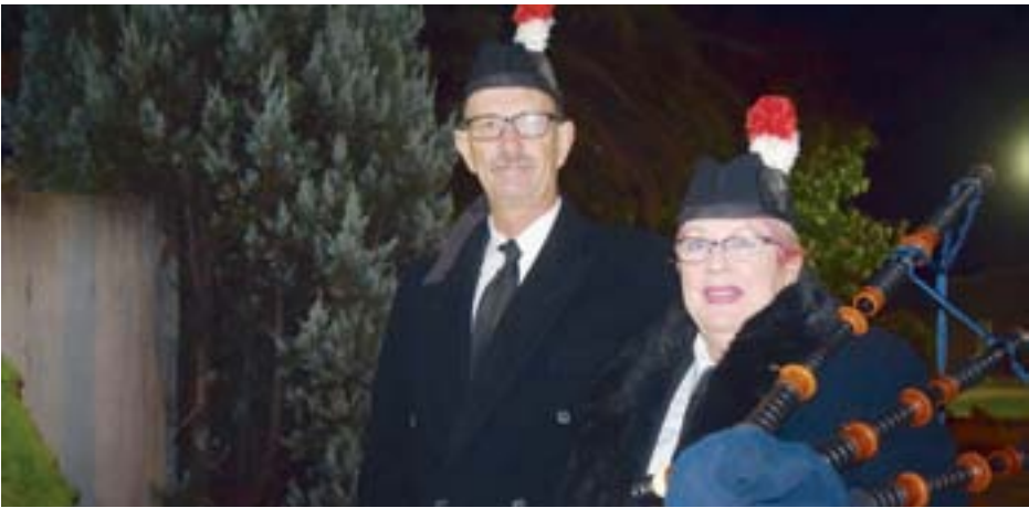
Braving the cold.