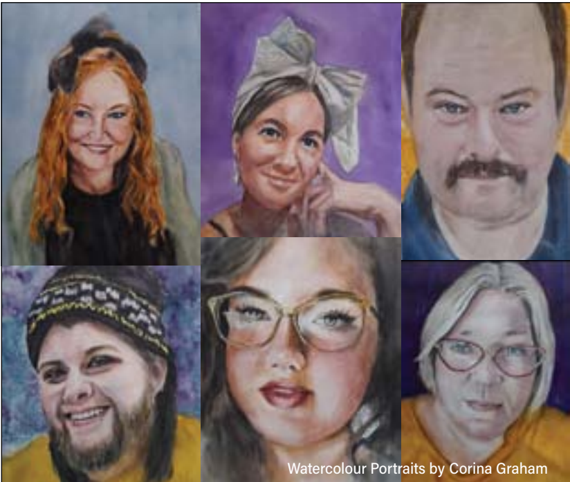
Watercolour Portraits by Corina Graham