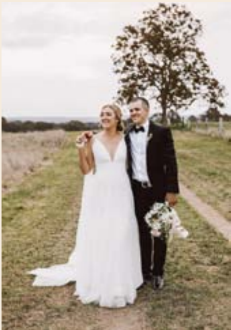
Enjoying the country wedding of their dreams.