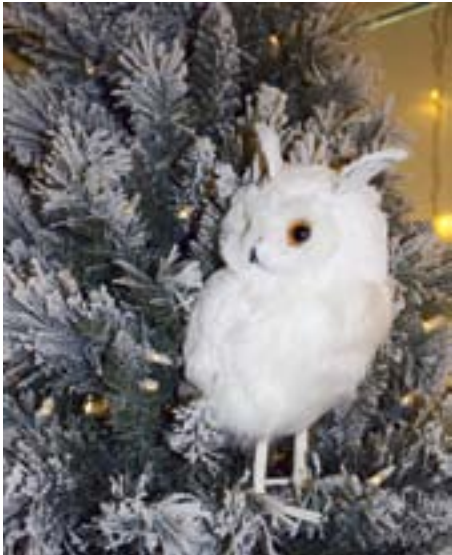
Ready to fly.