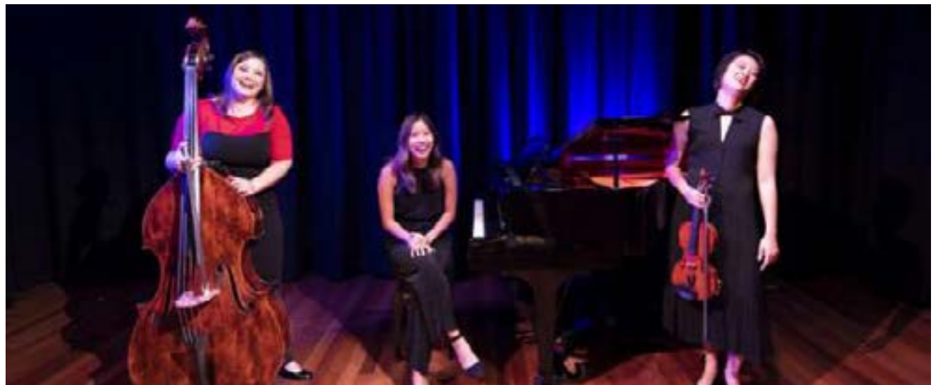
Tango Enigmatico are coming to Stanthorpe as part of their tour of regional Queensland.

"I went over to Portland to study at Tango for Musicians and also did some research and lessons in Buenos Aires, Argentina," she