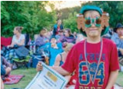
Christmas is coming to the Southern Downs with plenty of council events for young and old to enjoy.