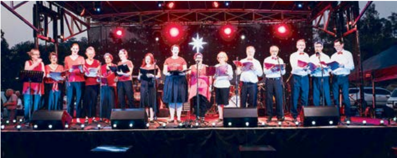
There is nothing more fun than carols at Christmas.