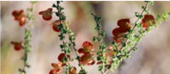
Dodonaea hirsuta Hairy hop bush.