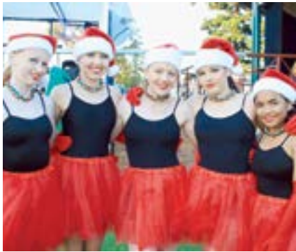
A time to come together.