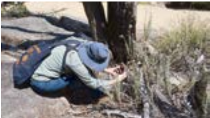
Photographing flannel flowers.