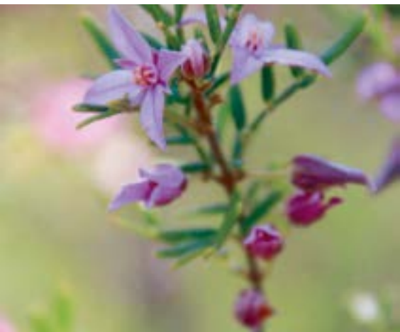
Boronia amabilis Lovely boronia.