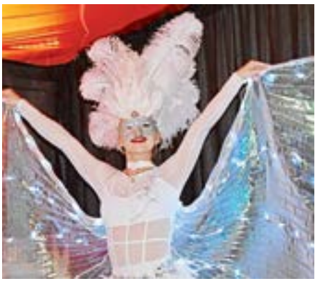
Performers on stilts wowed attendees at the business awards in 2019. (440982)