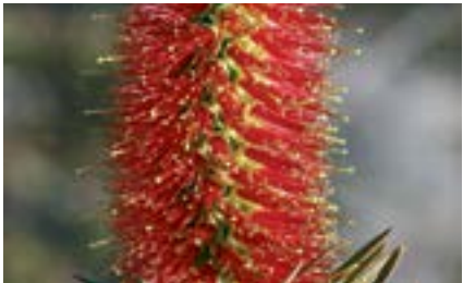
Melaleuca Linearis var. Linearis, Narrow-leaved bottlebrush.