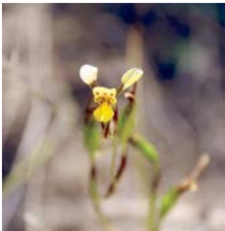
Diuris chrysantha Granite donkey orchid.