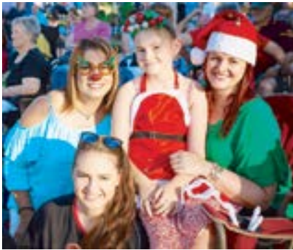
Christmas is for friends and family.