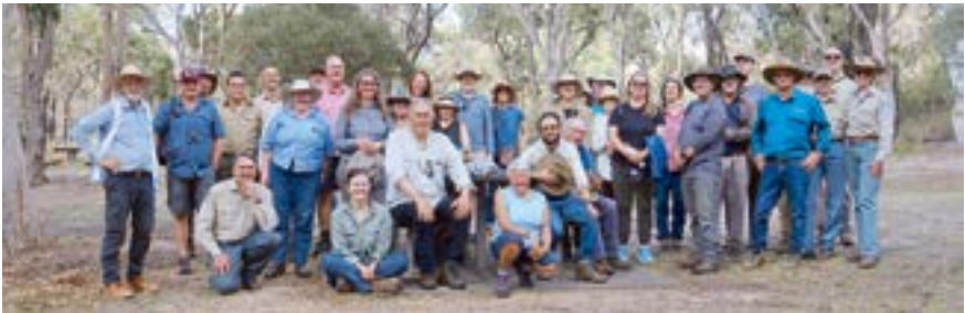
Conference attendees who attended the Junction Track walk.

"Although our initial focus was on rare plants with certainly expanded that to all of the flora on the Granite Belt.