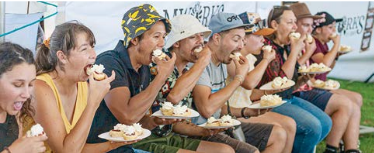
Tucking into the scones competitively.