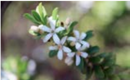
Philotheca epilosa Waxflower.