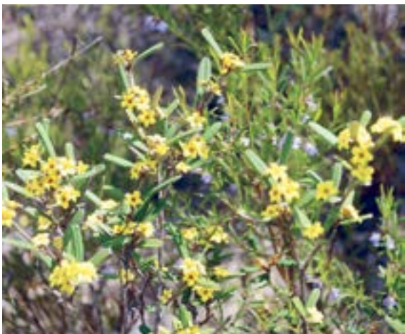
Phebalium whitei White's phebalium.