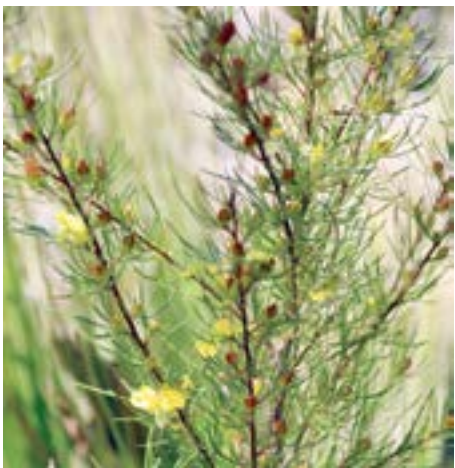
Hibbertia Elata, tall guinea flower.