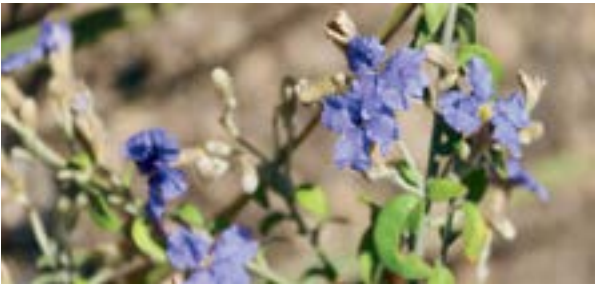
Dampiera purpurea Mountain dampiera.