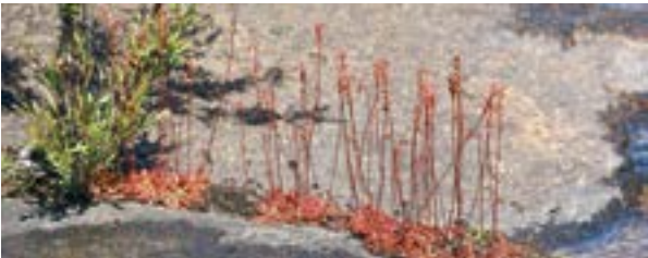
Drosera spatulata Rosy sundew.

"We have some amazing flora up here, I guess it's a mixture of our topography and climate. We have a bit of an overlap of plants coming down from the Sub Tropics and obviously who can handle a bit of cold which led to such a high diversity of flowering plants here.